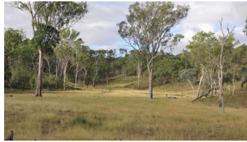
For You Deep Stillness

For you, deep stillness of the silent inland, For you, deep blue of the desert skies; For you, flame red of the rocks and stones, For you, sweet water from hidden springs, From the edges seek the heartlands, And when you're burnt by the journey, May the cool winds of the hovering Spirit Soothe and replenish you, In the name of Christ, in the name of Christ.